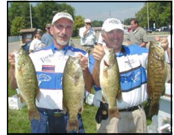
Strawberry Ridge was a huge sleeper spot.