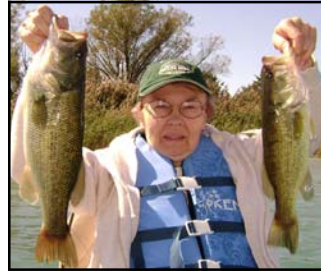
Mom worked out the pattern and knocked 'em down at Dickenson.